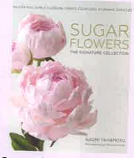
Sugar Flowers: The Signature Collection Naomi Yamamoto B. Dutton Publishing Photography: Takeharu Mioki £45.00

Wendy begins this book with a declaration that she LOVES cookies, and after looking through the immense contents page, it's hard to doubt that. With over 100 cookie recipes, this book has everything you need to create the biggest cookies you've ever tasted.